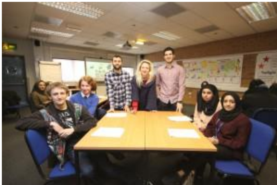
Above: The student group and facilitators exploring the solutions.