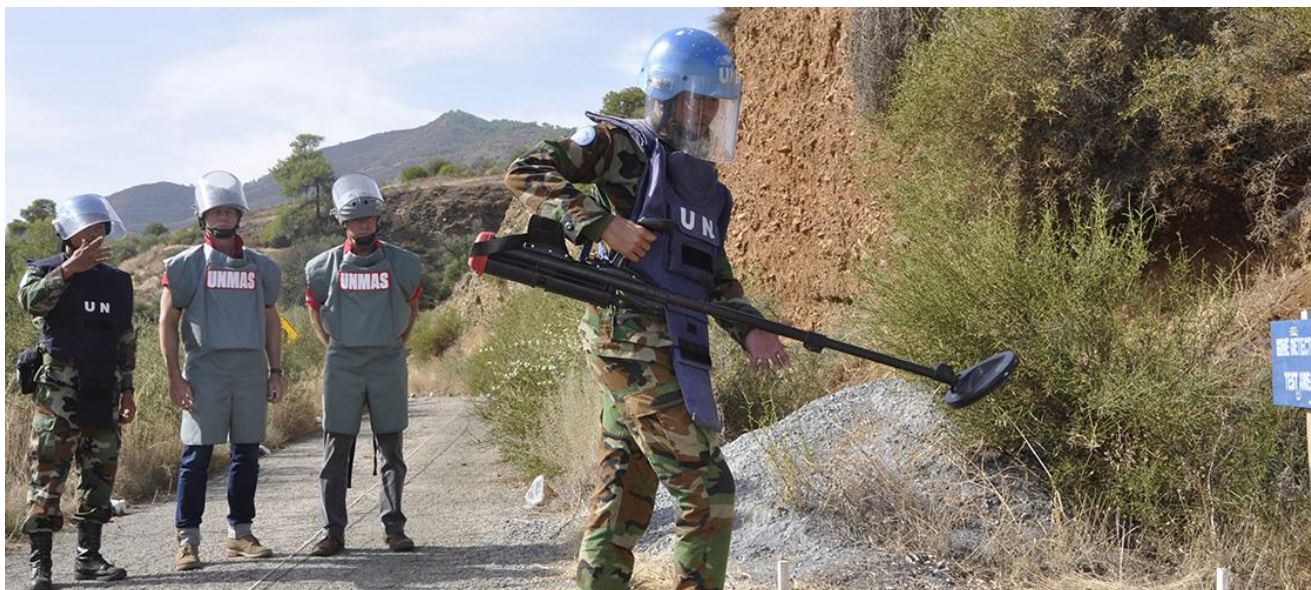
Photo above: The actor Daniel Craig (second left), the UN Global Advocate for the Elimination of Landmines, inspecting work to clear landmines in Cyprus

On 8 December 2005, the General Assembly of the United Nations declared that 4 April of each year shall be observed as the International Day for Mine Awareness and Assistance in Mine Action.